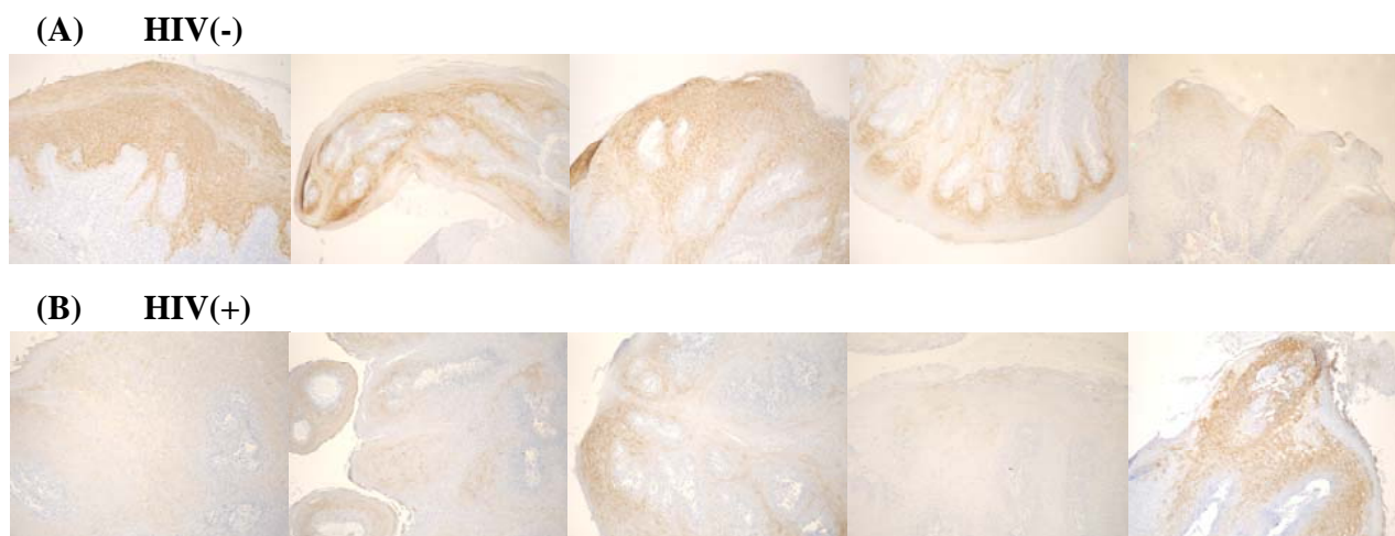
Fig. (2). Immunoperoxidase staining for cytokeratin 17. Variable staining of suprabasal keratinocytes is shown in papillomas removed from the oral mucosa. The overall observation is that of decreased staining intensity of oral papilloma keratinocytes in the HIV(+) patients (B) as compared to papillomas found in the HIV(-) patients (A) (100X), corroborating the iTRAQ quantification trend.